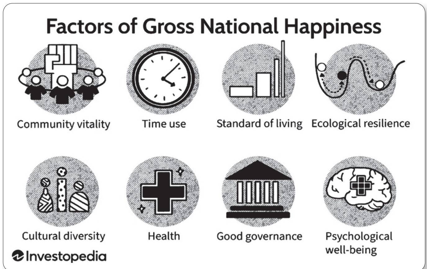
▲ Fig 1: (Liberto, 2022)

This study aims to understand the effects of the covid-19 pandemic on inner peace and happiness. The objective is to facilitate individuals towards cultivating inner peace and happiness in the new normal world, through a literature review.